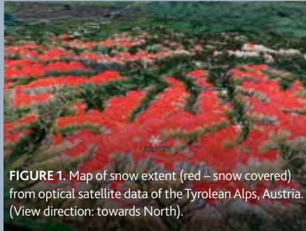
FIGURE 1. Map of snow extent (red – snow covered) from optical satellite data of the Tyrolean Alps, Austria. (View direction: towards North).

While significant steps have been made with the GMES (Global Monitoring for Environment and Security) utilising Europe’s investment in the space sector, at present, there is insufficient integration of the system where ice and snow is concerned. Given that snow and ice are key elements of the water cycle in many parts of Europe, this integration must be